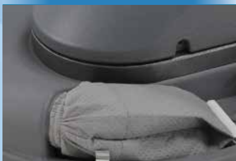
PASSIVE, VORTEX DUST CONTROL SYSTEM