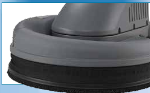
AIR-TIGHT SKIRTING DESIGN