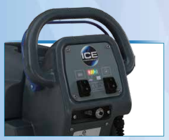
USER FRIENDLY TOUCH PANEL CONTROL SYSTEM