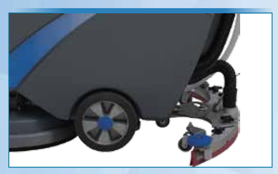
DIE-CAST ALUMINUM CURVED SQUEEGEE AND WHEELS